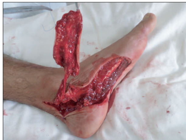
Fig 1 (c): Medial planter flap harvested