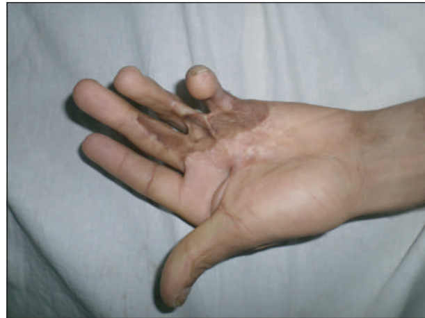
Fig 1(a): PBSC left hand

mid palmar space defect was 9X6cm. A free medial planter flap from left foot was harvested and used to resurface the defect.