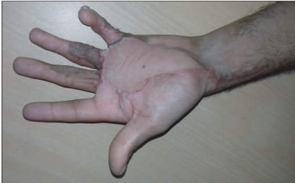
Fig 1 (e) and (f): Satisfactory finger extension, opposition and flexion after 13 months

Vascular anastomoses were performed between medial plantar vessels with radial artery and venae comitantes and cephalic vein in end to end fashion. Donor site was skin grafted.