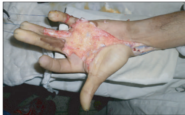
Fig 1 (b): Wound after release of contracture