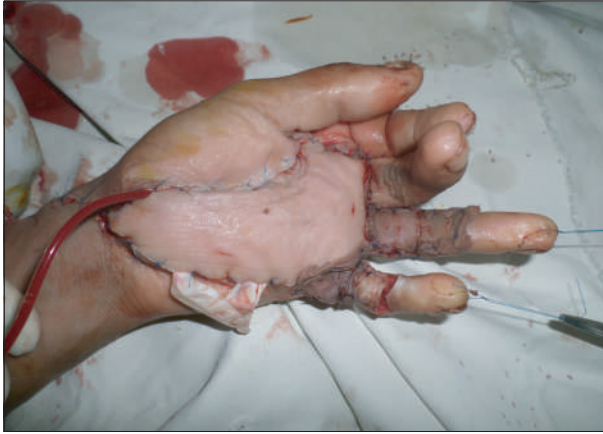
Fig 1 (d): Flap inset